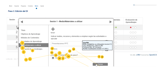
Figure 6. Gaze Plot of the wizard window when a user is changing the elements of a session.

With those tasks, it is possible to detect if the graphical user interface design is according with the users expectations and evaluate the tools' usability. The results of this test are shown in the Table 2.