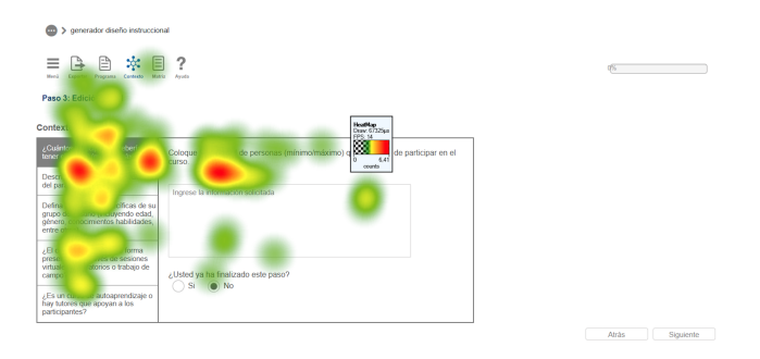
Figure 5. Heat Map of the context when a user is creating a new ID

ID Creation: The instructors had to access the ID Tool, create an ID, add three sections and complete the session one. An example of the result is seen in the Figure 5 by a heat map.